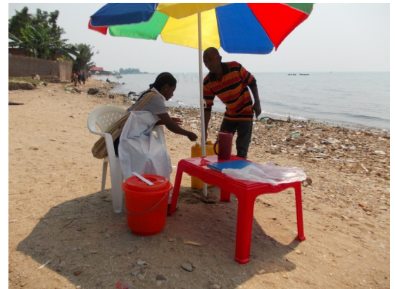
Bucket chlorination

The perceived benefits of bucket chlorination include that trained personnel apply an appropriate dose of chlorine directly into water storage containers, requiring little household-level behavior change.