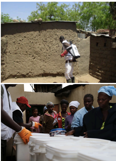
Household spraying (IFRC) and Household Disinfection Kit Distribution (MSF)