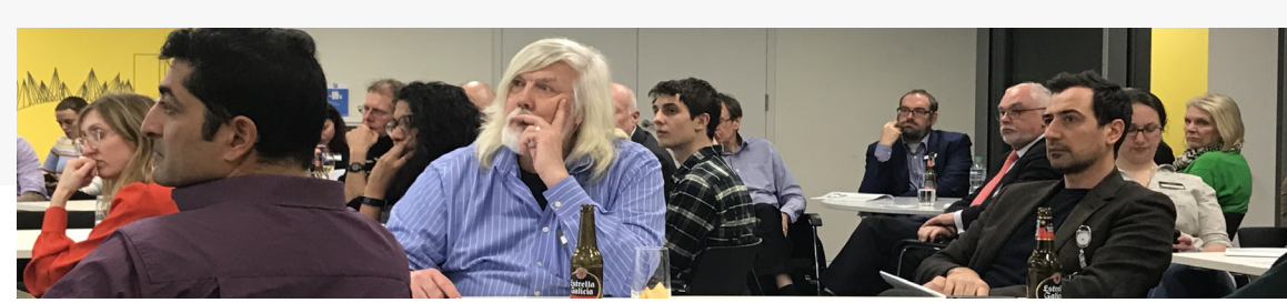
Launch event 22nd January 2019