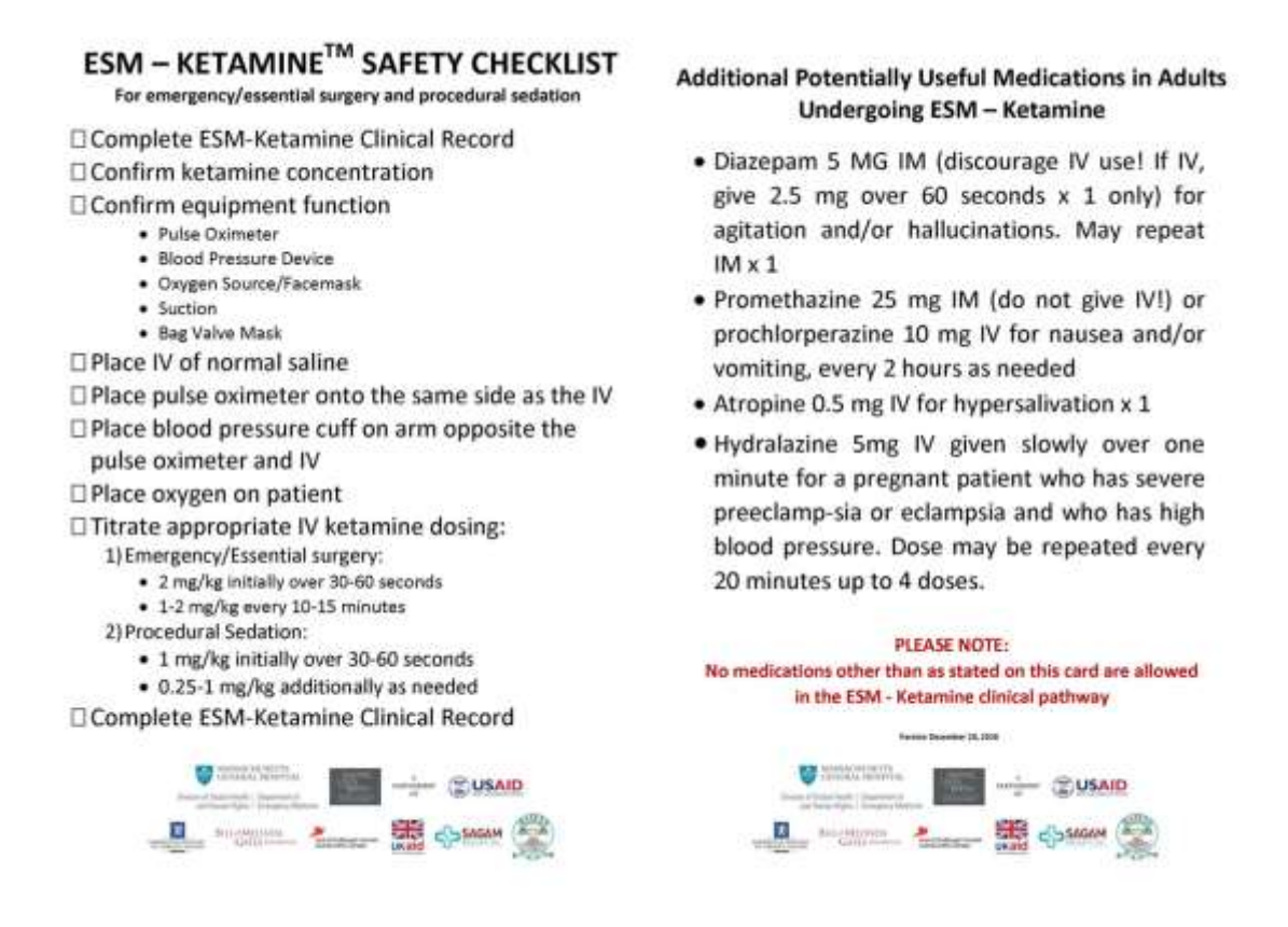
Figure 1: ESM- Ketamine Pocket Checklist (front and back)