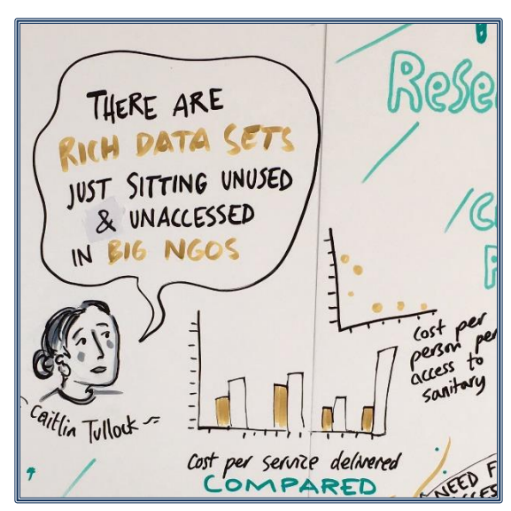
Forum Wall Art: Caitlin Tulloch, IRC