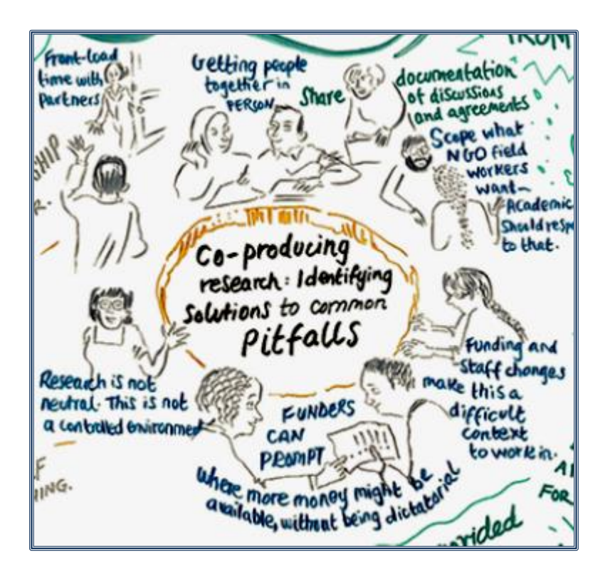
Snapshot from Wall Art: Co-Production Breakout