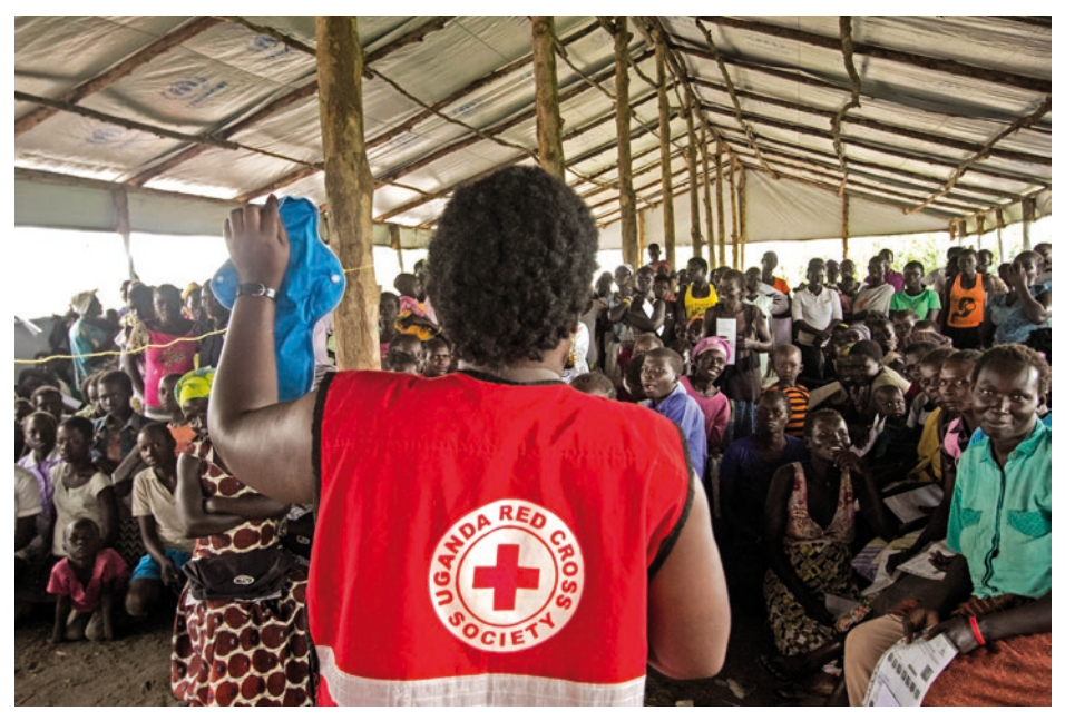
A Uganda Red Cross volunteer demonstrates how to use and care for reusable sanitary pads during the distribution of MHM kits; Impevi refugee settlement, Uganda, 2017.

Ensure that information on what is going to be distributed, to whom, when, why, and how the distribution process will work is communicated before, during, and after the actual distribution. Some 'consumable' items are quickly used up, such as soap and disposable pads. It is very important to be clear and up-front