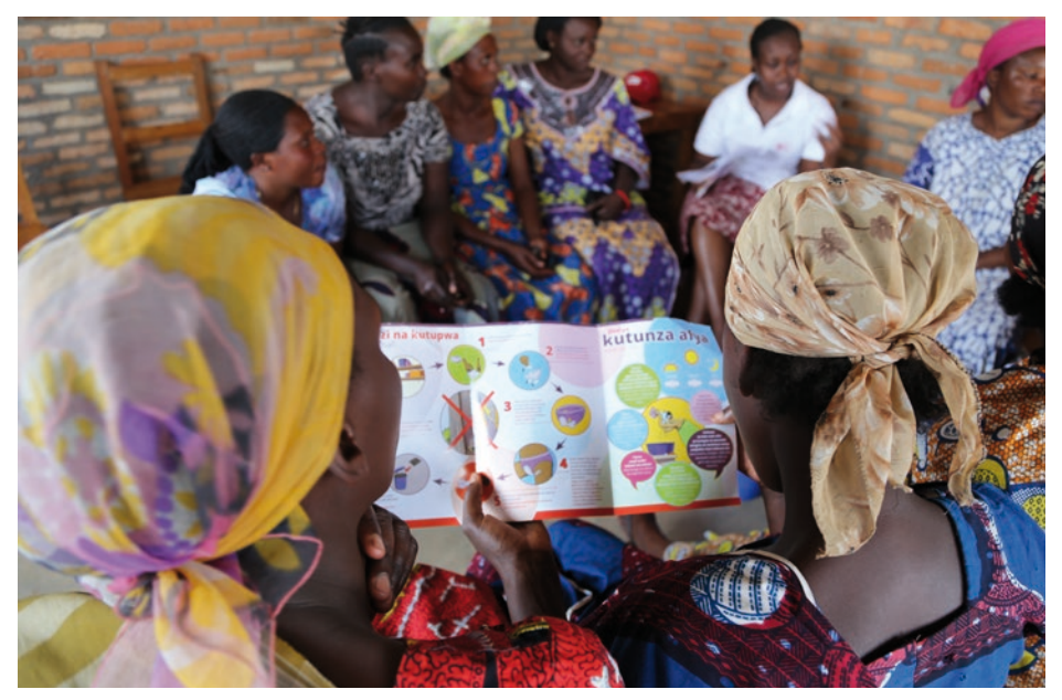
Women read the information brochure (included in each MHM kit) during a focus group discussion in Bwagariza refugee camp; Burundi, 2013.