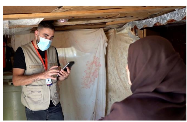
A Nabad staff member documents COVID-19 related perceptions on his mobile device while speaking with a woman in a settlement for Syrian Refugees in Lebanon.

The study, which tested the CPT in Lebanon and Zimbabwe, illustrates that adopting a systematic process which encourages all implementation staff to actively listen to communities, track perceptions and then act on the trends that emerge, is valued by staff and leads to more acceptable and relevant programming during outbreaks. The CPT process provided humanitarian staff with real-time data on community perceptions and priorities. This was used to inform programme implementation and decision making. While the CPT can be improved, findings illustrate that routinely documenting community perceptions can add value to humanitarian response during disease outbreaks.